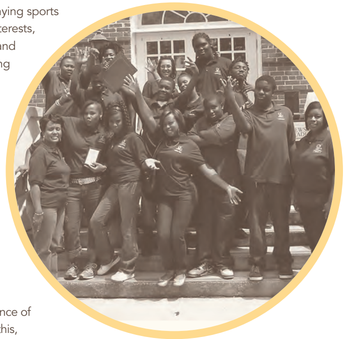
Students celebrate their graduation from Nassau County's Data Busters program.